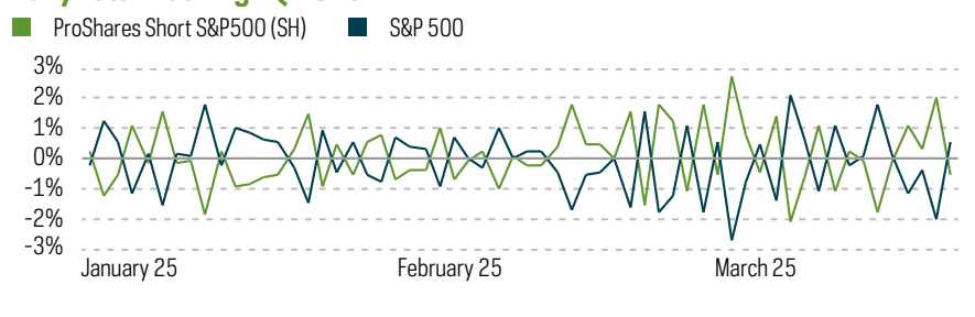
Daily return during 10 2025

The performance quoted represents past performance and does not guarantee future results. Investment return and principal value of an investment will fluctuate so that an investor's shares, when sold or redeemed, may be worth more or less than the original cost. Current performance may be lower or higher than the performance quoted. Performance data current to the most recent month-end may be obtained by calling 866.776.5125 or visiting ProShares.com. Index performance does not reflect any management fees, transaction costs or expenses. Indexes are unmanaged and one cannot invest directly in any index.